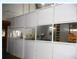
Clean Room Manufacturing Cell